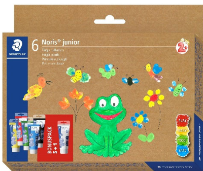
Caption: With Noris junior finger paints in six brilliant colours even the littlest ones playfully foster their creativity and colour recognition. They are available in a practical new tube in sets of four or six or in large, single bottles.