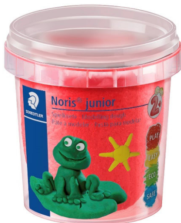
Caption: With the Noris junior modelling dough from STAEDTLER, children can playfully combine colours and shapes and at the same time also train to use the right amount of force. The soft and easy to mix dough does not stick and guarantees clean hands even in intense kneading pleasure.