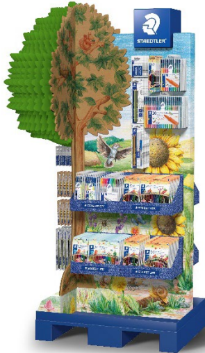
Caption: The classic back-to-school floor display will catch the eye in 2021 thanks to its unusual tree shape.