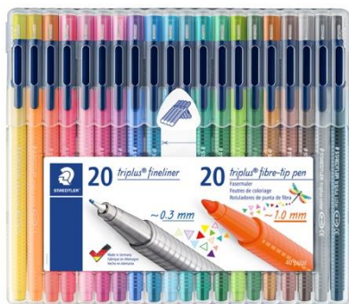
The STAEDTLER Box is now also available with 40 pens