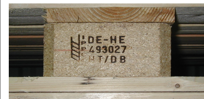
Illustration 1: IPPC icon on base of new Euro pallet

The pallet bottom runners and base must be undamaged.