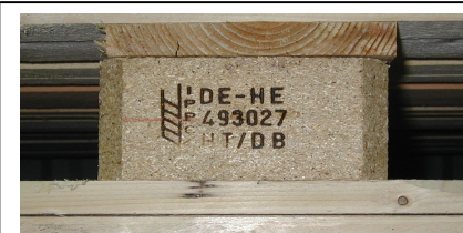
Illustration 1: IPPC icon on base of new Euro pallet

The pallet bottom runners and base must be undamaged.