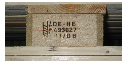
Illustration 1: IPPC icon on base of new Euro pallet

The pallet bottom runners and base must be undamaged.