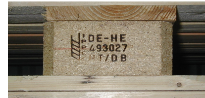
Illustration 1: IPPC icon on base of new Euro pallet

The pallet bottom runners and base must be undamaged.