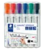
351 B-9 (black) / 351 B-2 (red) 351 B-3 (blue) / 351 B-5 (green) 351 B-4 (orange) / 351 B-6 (purple) chisel tip