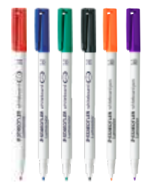
301-9 (black) / 301-2 (red) 301-3 (blue) / 301-5 (green) 301-4 (orange) / 301-6 (purple)