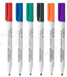
341-9 (black) / 341-2 (red) 341-3 (blue) / 341-5 (green) 341-4 (orange) / 341-6 (purple)