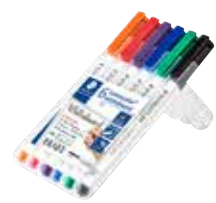
301 WP6 Wallet of 6