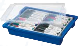
341 G144 Tote tray of 144