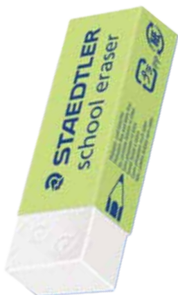
526 C20 Dimensions 65x23x13 mm